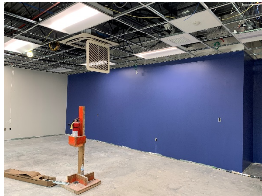
Paint At New Addition