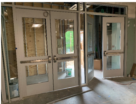
Interior Storefront Entrance