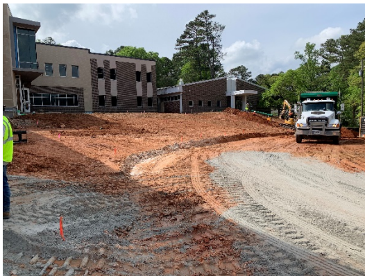
Front Entry Grading