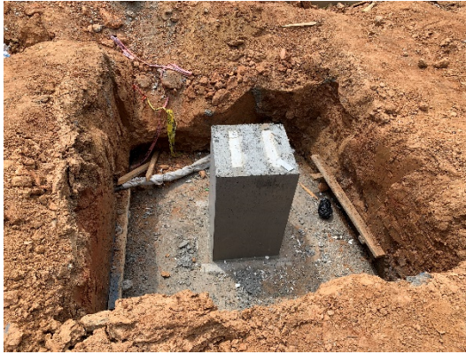
South Elevation Canopy Footing