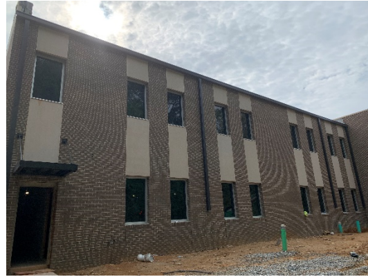
West Elevation Roof Gutters